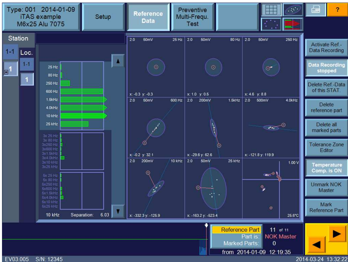
Screen of the eddyvisor ® with activated iTAS

As usual, the instrument is calibrated with only OK parts. Now, however, OK parts at different temperatures are also included in order to generate a temperature compensation curve.