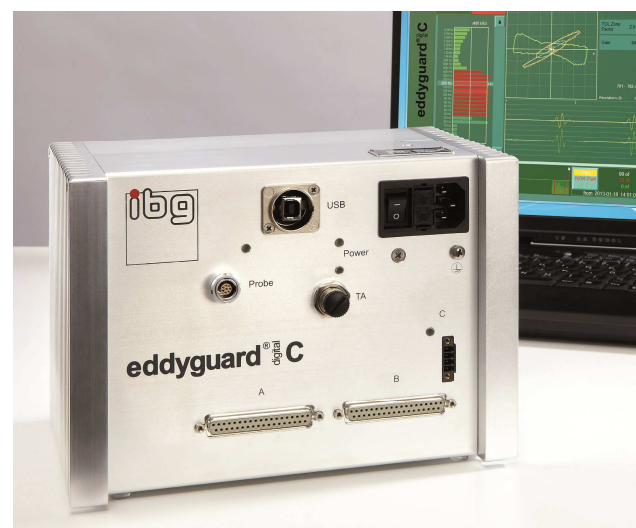
eddyguard® S and eddyguard® C