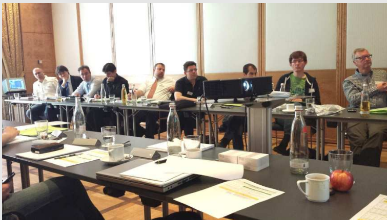
ibg Technical Meeting in Stuttgart

The aim of these meetings is continuous training and development of the skills of our sales partners, the presentation of new products and features and the exchange of ideas. This year’s main topic was the presentation of our new temperature adaptive tool iTAS.